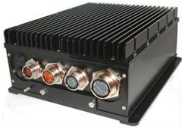
GRIP Epsilon with removable drive

General-purpose Rugged Integrated Processor Convection Cooled