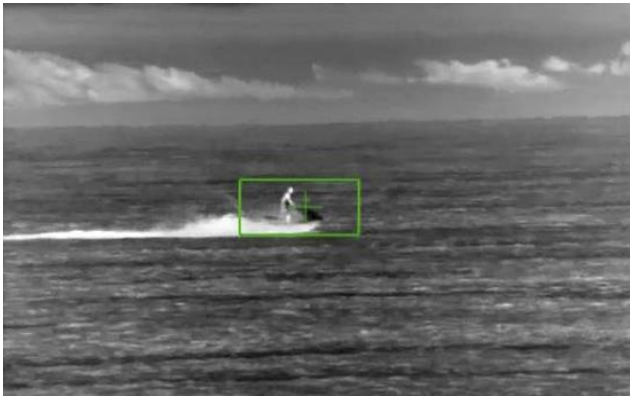
Tracking a jet-ski using IR video

The Vision4ce CHARM-104 product uses the DART (Detection & Acquisition, with Robust Tracking) detection and target tracking software hosted on an embedded multicore processor board for video tracking and complex image processing applications.